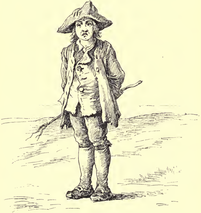
‘Saw a boy, who looked very melancholy.’

‘it is not the workmen’s dinner hour, and they are gone from the work at the lighthouse ; and the horses and cars are left without any one with them.’ He went on a few paces, and saw a boy, who seemed to be left to watch the horses, and who